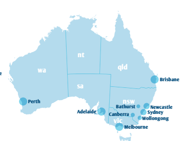
Competitor Two East coast major cities, Adelaide & Perth