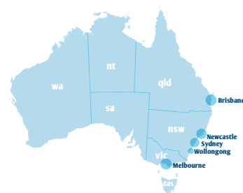
Competitor One East coast major cities